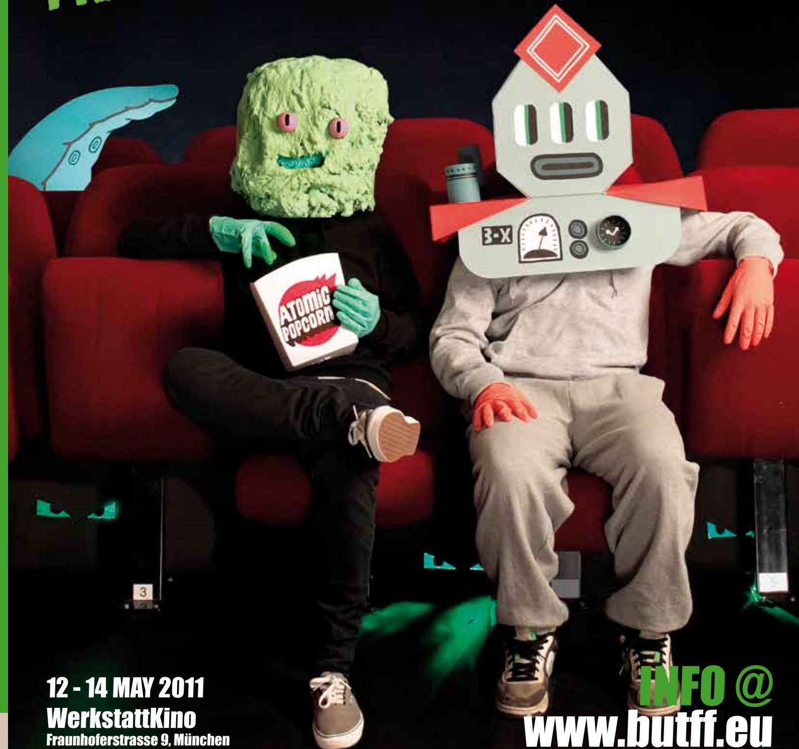
Cover: Rick Berkelmans - Design: Doreen Eggink

12 - 14 MAY 2011 WerkstattKino Fraunhoferstrasse 9, München